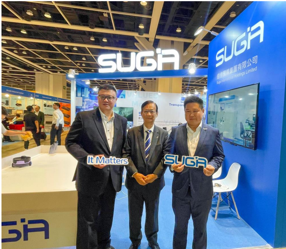
Photo caption: SUGA's management is present at the Electronics Fair

This year's Hong Kong Electronics Fair focuses on promoting digital entertainment products, which is in line with SUGA's product strategy, having participated in the fair 18 times to date. By fully demonstrating its diversified product portfolio and proven production capabilities, and actively interacting with potential partners, SUGA has laid a solid foundation for the Group's future steady innovative development and will provide customers with more innovative and high-quality products.