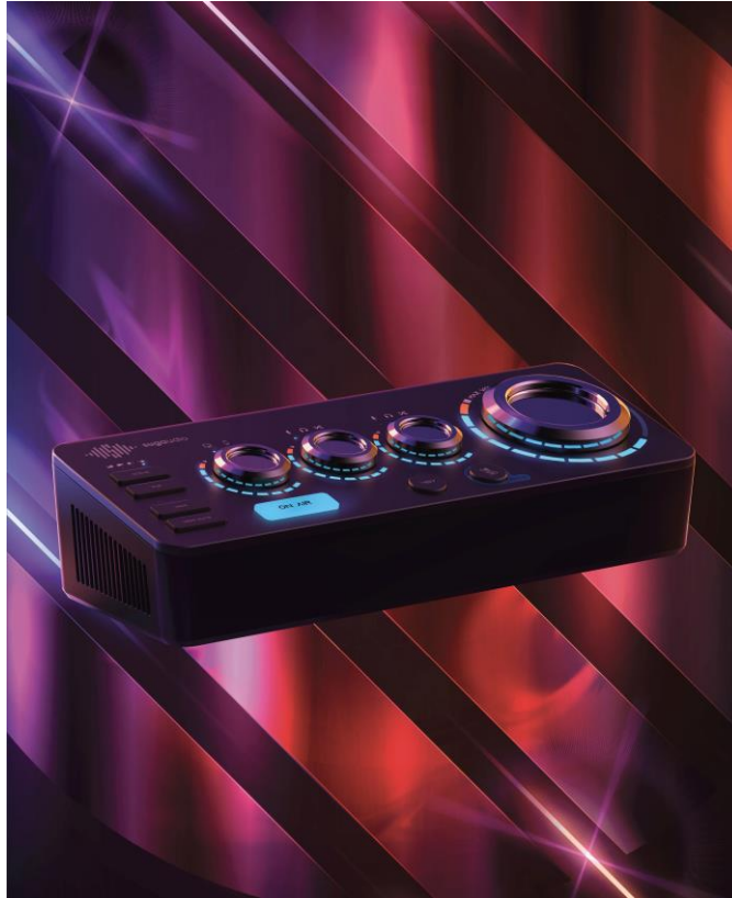
Photo Caption: SUGA's Stream Desk, an audio and video streaming interface